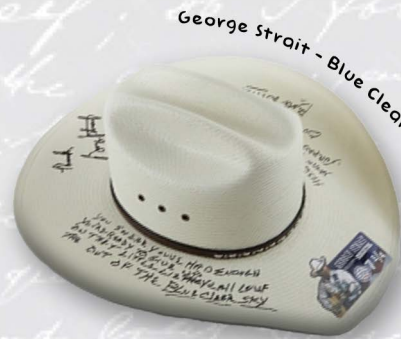
George Strait - Blue Clear Sky