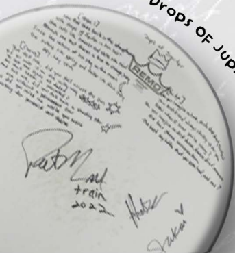
Train - Drops of Jupiter