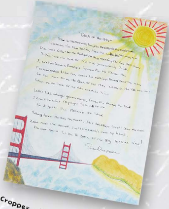
Steve Cropper - (Sittin' On) The Dock of the Bay