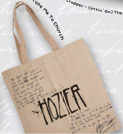
Hozier - Take Me To Church